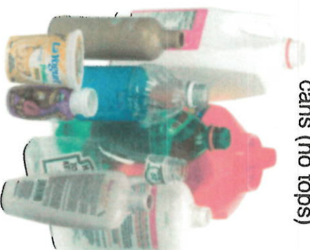
plastic containers marked #1, #2, or #5