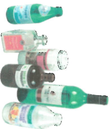
glass food & drink containers (no tops/lids)

Do NOT recycle: Styrofoam, pizza boxes, wax coated food/drink containers or wax cardboard, items with food residue, paper cups or plates, paper towels, bubble wrap, microwave trays, food trays and party trays even if it's #1 #2 or #5 plastic, antifreeze and oil containers, window or auto glass, light bulbs, ceramic, plastic without a number, needles/syringes, hazardous materials, pesticides, chemicals, plastic film, coat hangers, paint cans, aerosol cans, tar pails, vacuum or pool hoses, pool liners, shower curtains, PVC pipe, plumbing accessories, toys, building products, plastic fencing, wire, electrical equipment, dishware, pots, pans, toasters and small appliance, flower pots, nursery trays for plants, rubber hoses, general household items, construction debris, yard waste.