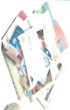
mixed paper/ junk mail