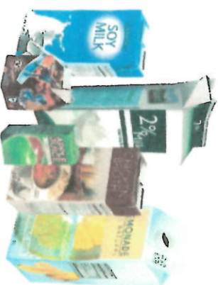
food & drink cartons (no tops)