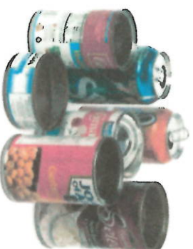
metal food and soda cans (no tops)