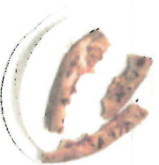
items with food residue