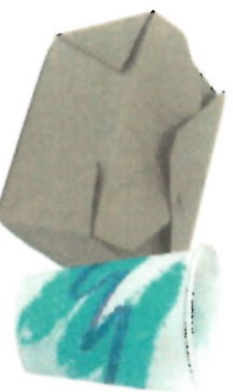
wax coated food and drink containers or waxed cardboard