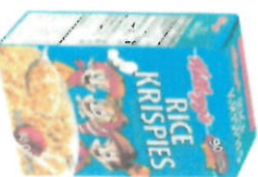
cereal boxes (remove plastic liner)