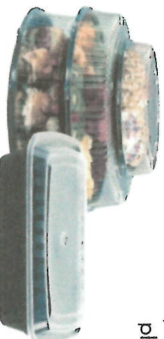
food trays and party trays (even if it's #1 #2 or #5 plastic)