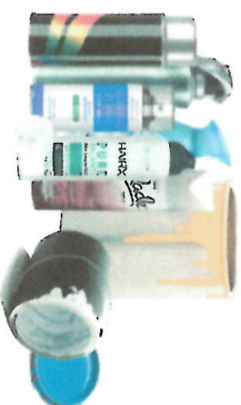
paint or aerosol cans