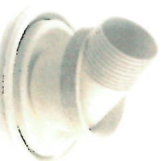
paper cups/towels/ plates