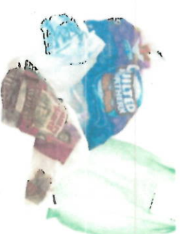
plastic bags and plastic film